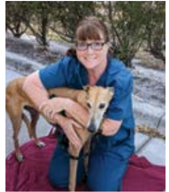
Even the dogs like a bingo night out!