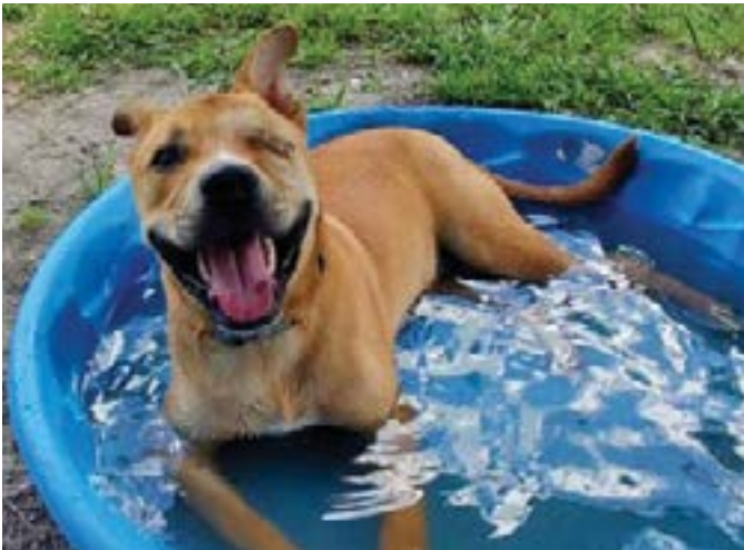
Archie enjoying the pool! This just warms our hearts as we see him enjoy the little things in life such as a little pool.