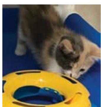
Our kittens and cats are loved and cared for by a very dedicated group of volunteers.

When our volunteers arrive every morning, they are greeted by eager feline faces waiting for breakfast.