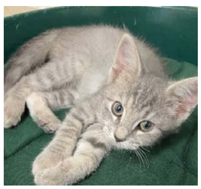
We welcome all persons who would like to spend a bit of time in our cattery. Volunteer hours are usually a two-hour shift once a week but times are very flexible.

When the cats have been fed and the litter boxes and rooms have been cleaned the fun begins! We have plenty of toys and activities to keep everyone happy. The purring is non-stop! We have an ongoing volunteer group throughout the day who continuously monitor the cats and their environment.