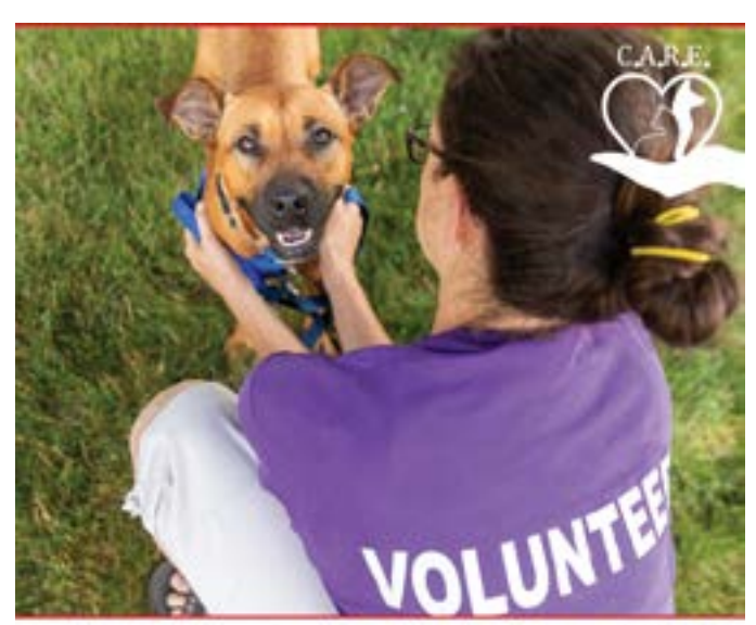
Become a volunteer today and make a difference in a shelter pet!

This little orange kitten is also a part of the litter of five kittens that were Surrendered to C.A.R.E.. You can usually find this kitten out on the lanai enjoying some fresh air and watching the wildlife through the screen. Playing with toys and finding fun spots to investigate fill this cutie's day. Stop by and meet this frisky kitty.