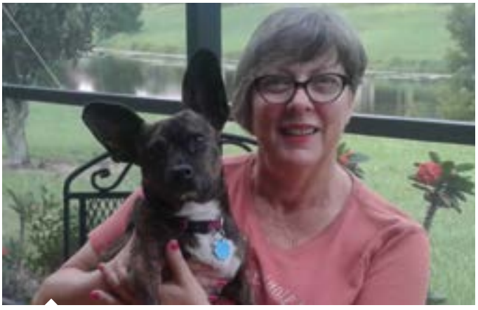
Honey Bunny & Cheri

The success of our shelter depends on the support of our local community. That's where the Community Outreach Committee comes in.