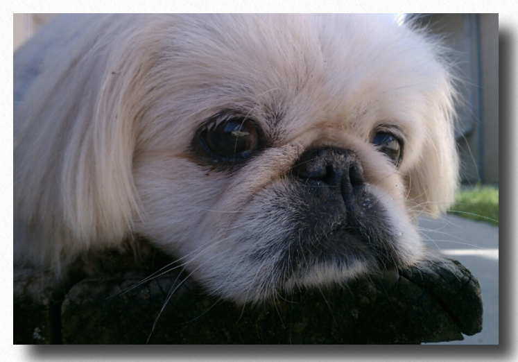
Quiet Time too! - Your dog can stay beside you while you do homework or watch TV.

Dog Parks & Dog Beaches – Find out if your neighborhood has a place where your dog can run off their leash. Remember that there will be other dogs there, too, and your dog must understand basic commands like "sit", "come" and "stay". Your dog must also have updated protection from vaccinations. You should never go alone, but always with an adult.